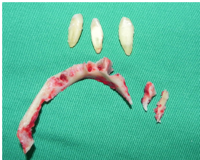
Figure 3 - Bone fragment corresponding to the residual alveolar process involved and the teeth extracted