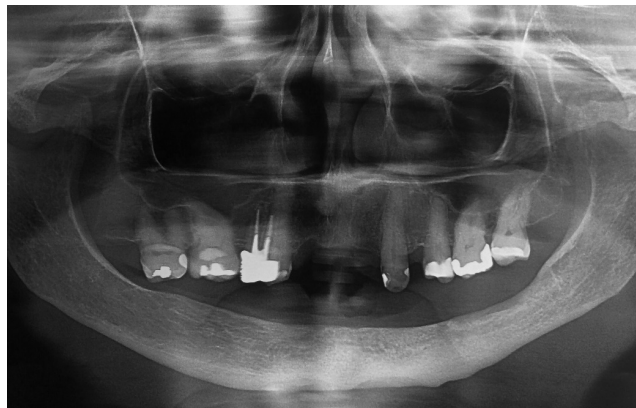
Figure 6 - Panoramic radiography at 16 months postoperative