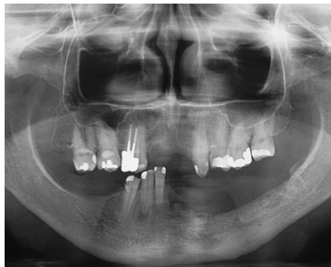
Figure 2 – Initial radiographic image, with bone exposure and bone density alterations in the right anterior mandibular region