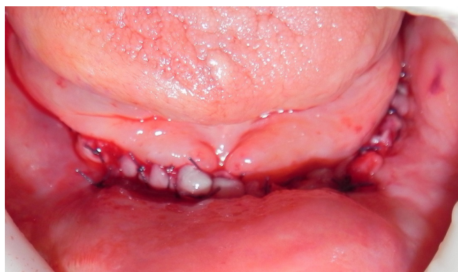
Figure 4 - Immediate postoperative. Closure of the borders was performed by primary intention and with no excessive tension