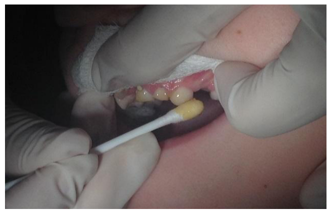
Figure 5 - Fluoride varnish application

After 3 months, the patient was reassessed to control oral health. The mother could not perform oral hygiene and cariogenic diet continued. At clinical examination, some GIC restorations fractured and the child had active white spots on other teeth (figures 6, 7, and 8). Furthermore, the mother reported that the boy should undergo a diet due to overweight.