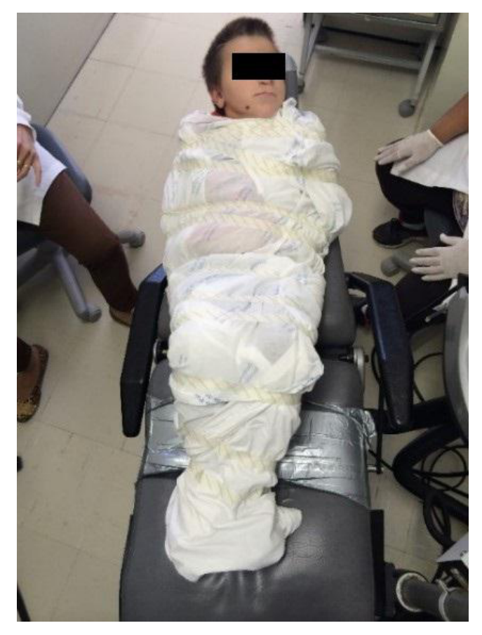
Figure 1 - Physical restraint

After the reading and signing of the Free and Clarified Consent Form, the child was submitted to physical restraint aiming at his safe, and at assuring the treatment quality, due to his noncooperative behavior (figure 1).