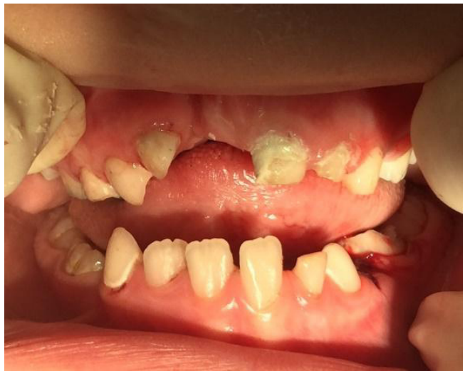
Figure 9 - Child under general anesthesia through nasal intubation