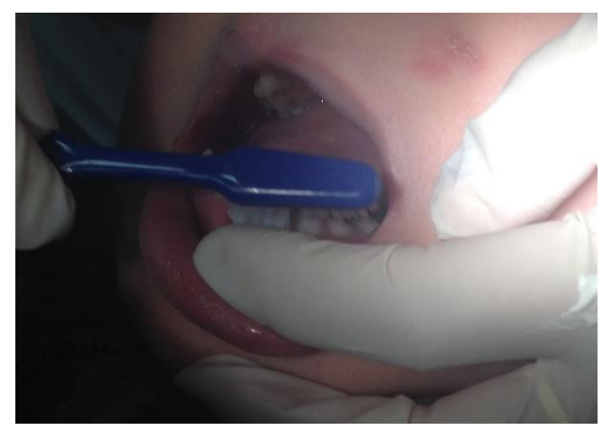
Figure 4 - Tooth brushing