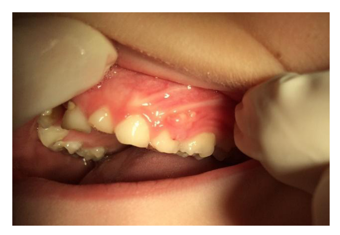
Figure 2 – Endodontic fistula of tooth #64

The tooth #64 showed endodontic fistula and deep large dentin carious lesion (figure 2), and thus extraction was indicated because of the impossibility of performing the radiographic examination due to noncompliance and impossibility to restore the tooth.