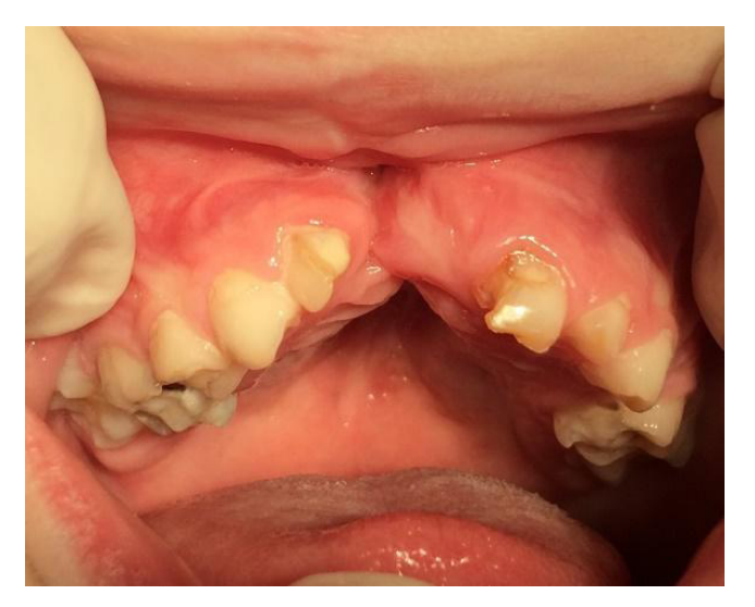
Figure 6 - Initial aspect of the maxillary teeth