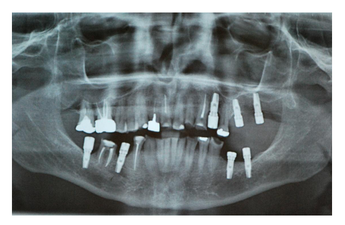
Figure 4 - Panoramic radiography. Implants on the area of teeth #24, #26, #27, #36, #37, #45, and #47; endodontic treatment in teeth #11, #12, #16, #23, #44, and #46; crowns on teeth #16 and #17; core + crown on tooth #12, amalgam restoration on tooth #25 and glass ionomer cement restoration on teeth #11, #23, #44, and #26