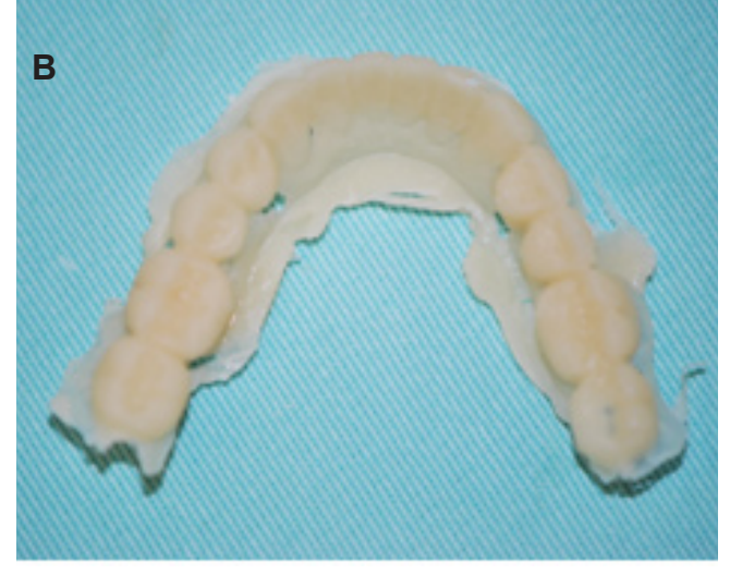
Figures 9A and 9B - A = Silicone matrix technique; B = Provisional prosthesis after its removal from silicone matrix before finishing procedure