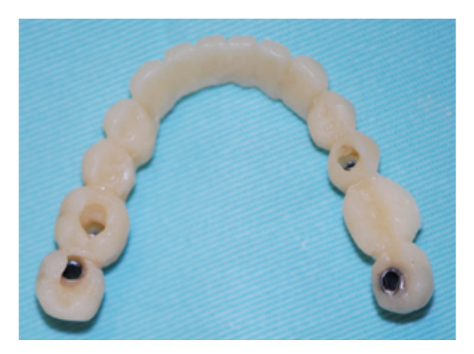
Figure 10 - Provisional prosthesis with captured UCLA abutments and after the finishing and polishing procedure

In seeking to seal the teeth/prosthesis interface, it was used glass ionomer cement (GIC) (Vidrion C, SS White, Rio de Janeiro - RJ, Brazil) to avoid marginal leakage and reduce sensitivity of worn teeth. This material was chose due to its capability to release fluoride.