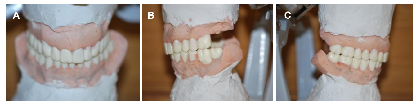
Figures 7A, 7B and 7C - Waxing from frontal (A), left side (B), and right side (C) view