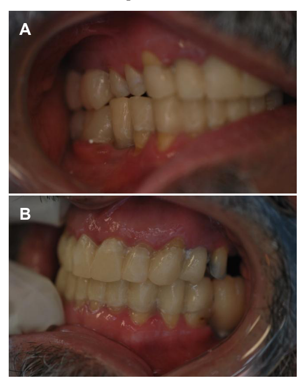
Figures 13A and B - Final aspect from right (A) and left side (B) showing reestablished occlusal contacts

The hygiene instruction was performed after the provisional prostheses installation. After 15 and 30 days, maintenance was done to evaluate the occlusal condition and hygiene. Temporary occlusal acetate splint (BIOART, San Carlos - SP, Brazil) was constructed for the upper arch, aiming at the protection of the prosthetic work and avoid the deleterious effects of bruxism. Figures 13A, 13B, 14, 15A and 15B shows the provisional prostheses finished installed on patient's mouth.