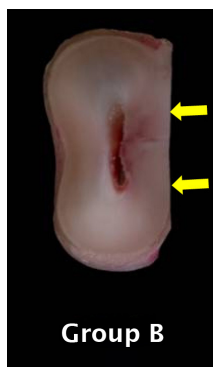
Figure 3 - Image of root section from group B. Arrows indicate risk zones

After the measurements were obtained, they were submitted to statistical analysis using the Student's t-test for independent samples at 5% significance level.