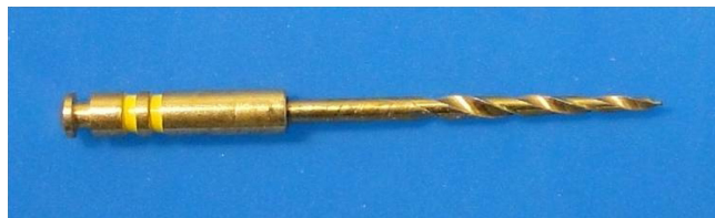
Figure 1 - Picture of the LA AXXESS® used in the study

The teeth were randomly distributed into two experimental groups. Group A, comprised 20 teeth, where cervical flaring was carried out using a LA AXXESS® drill (SymbroEndo, Glendora, USA) size 20 taper 0.6 (figure 1). Group B, was composed of 10 teeth, as control for tissue wear, where cervical flaring was not performed, and an anatomical mean was obtained in relation to the security zone.