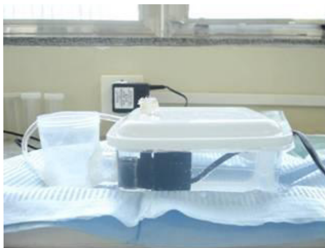
Figure 1 - Device constructed to perform the tests

The solutions were kept in a dry, fresh place, under environment temperature to maintain their physical-chemical characteristics. To conduct the bovine pulp dissolution test, a 10-100ml collector was adapted by previously perforating both sides. At one side, a urethane tube was adapted; at the other side, another tube was connected to link the collector to the circulation pump (SB 160; aquarium pump) (figure 1). The pump was placed into a plastic flask inside water. The bovine pulp fragments previously weighed with the aid of a precision scale were placed into the collectors with the aid of a net so that they became total immersed in the irrigants.