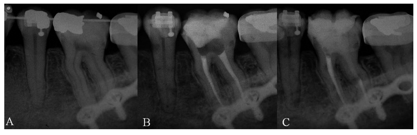
Figure 1 – (A) Initial radiograph showing the impossibility of visualization of the apex due to the presence of a mandible retaining plate. (B) Radiograph performed after endodontic treatment, in which the working length determination was performed by using the electronic apex locator. (C) Final radiograph after restoration procedures