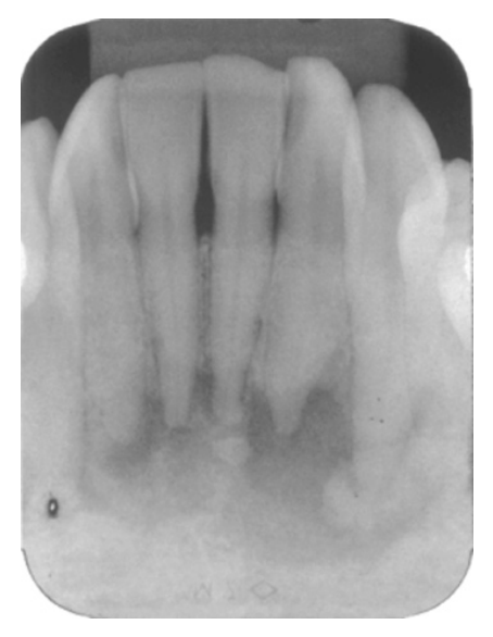
Figure 2 - Radiolucent aspect of the lesion with radiopaque areas maintaining the lamina dura