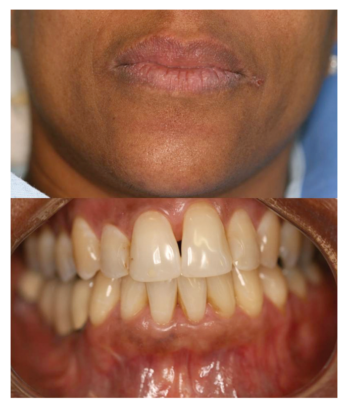
Figure 3 - Chin area and oral mucosa with normal aspect